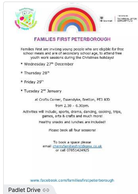
HAF Winter FFP poster 12 - 16 years