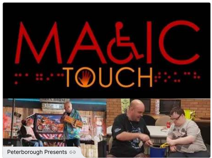
Peterborough Presents ⇨ Accessible Magic Show with Magic Touch | Peterborough Presents

Click here for more information and for details on how to register.