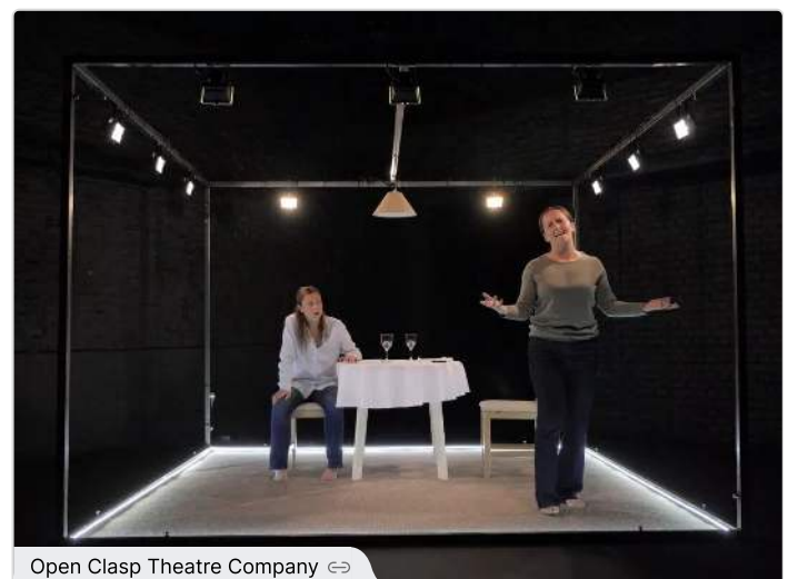
Open Clasp Theatre Company ⇒

Rattle Snake tells the real-life stories of women who have faced and survived coercive controlling domestic abuse.