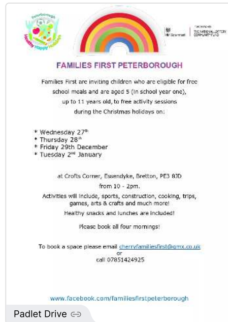
HAF Winter FFP poster 5 - 11 years

2 projects offering free positive activities for children and young people at Crofts Corner!