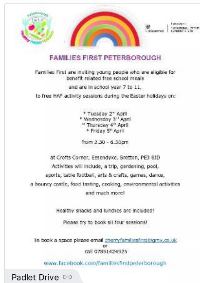
FPP Young Peoples Easter HAF poster