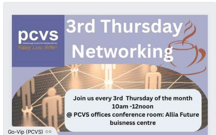
Third Thursday Networking: MEET THE FUNDER CCF | Go-Vip (PCVS)