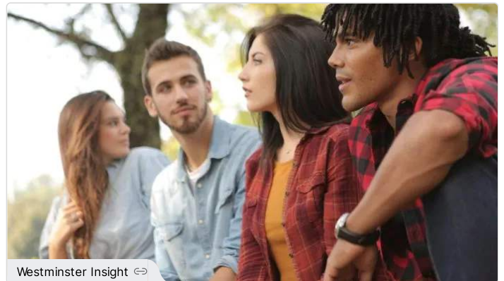
Westminster Insight ⇄

*Please note that the costs for this course are quite high but the subject matter is appropriate for many of PCVS VCS members.