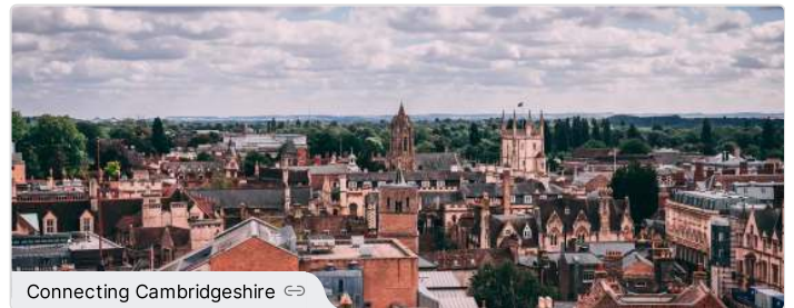
Connecting Cambridgeshire - Connecting Cambridgeshire

Connecting.Cambridgeshire@cambridgeshire.gov.uk