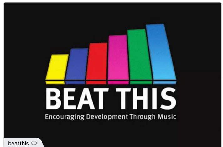
Beat This | Community Music Workshops

We are aiming to receive a clearer picture about how we can support more musicians in the city and want to give them the chance to express themselves freely, make music in a safe and creative environment and instil in them, the confidence to release their own music and even perform live. Click here to get involved.