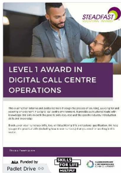
Level 1 award in Digital Call Centre Operations CPCA

If your participants are interested in any of these courses, then please email upskill@steadfasttraining.co.uk with their name, telephone number and the course so we can get in touch and register them onto the course.