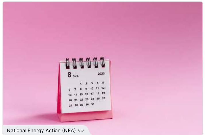
National Energy Action (NEA) ⇄

NEA's free Fuel Poverty Forums are aimed at frontline service providers, to examine practical and policy initiatives related to fuel poverty and delivering energy efficiency solutions at a local, regional and national level. The regional Forums showcase innovation, good practice and promote dialogue and discussion on a wide range of sectoral issues to help NEA shape policy developments and campaigns. The Eastern region forum takes place in Ipswich on April 17th. Click here to register.