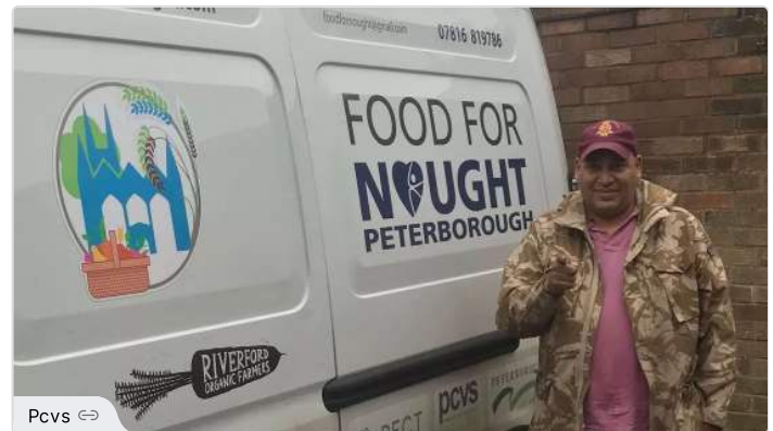
Funding & Support

Check out the PCVS website's 'Funding and Support' section where you will be able to find out the latest funding opportunities offered by PCVS and other organisations through the link to Funding Newsletter. Click here to access the funding and support page and don't forget to check back for regular updates.