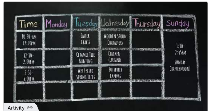
Activity ⇒ Holiday Workshops

We run our workshops from our studio at Swines Meadow Farm Nursery, 47 Towngate East, Market Deeping PE6 8LQ . Parking is available, and there is a self service café onsite. Our workshops are open to all ages from Reception up unless specified- we like to have different age groups working alongside each other! Preschool children are also welcome with an accompanying adult. Booked on a first come, first served basis- places are limited to ensure plenty of individual support and guidance. For more information or to book, please get in touch using the contact page or by emailing hello@artivitystudios.co.uk .