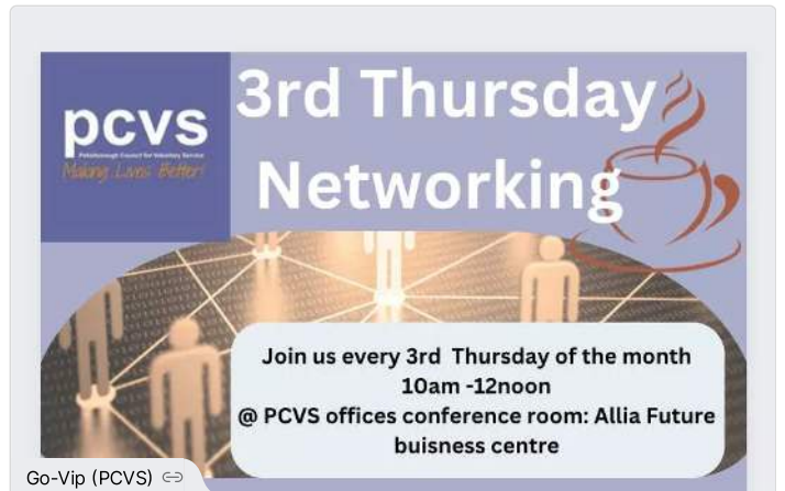
Go-Vip (PCVS) ⇄