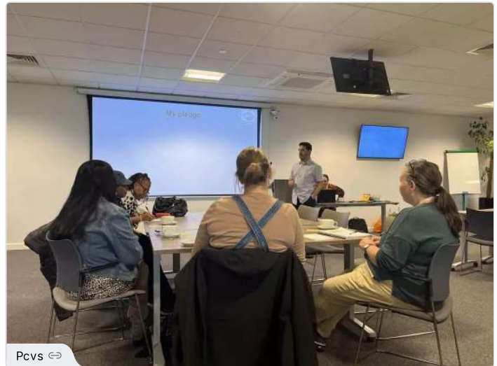
Training and Support Sessions

Check out the PCVS website 'Training and Support' section where you will be able to find out the latest VCS training sessions offered by PCVS and other organisations through the link to new Training Newsletter. Don't forget to book onto our monthly Third Thursday Networking sessions while you are there. Click here to access the training page.