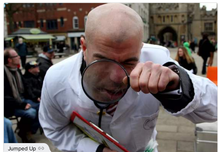
Peterborough Culture Forum: Support and connection for people interested in arts and culture - Jumped Up

Or comment on the Facebook event to be sent a link directly: https://fb.me/e/6DRyo0pyP