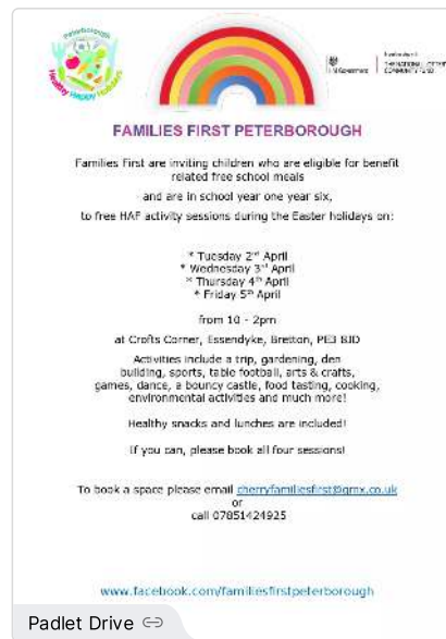
Padlet Drive ⇒ FFP Childrens Easter HAF poster